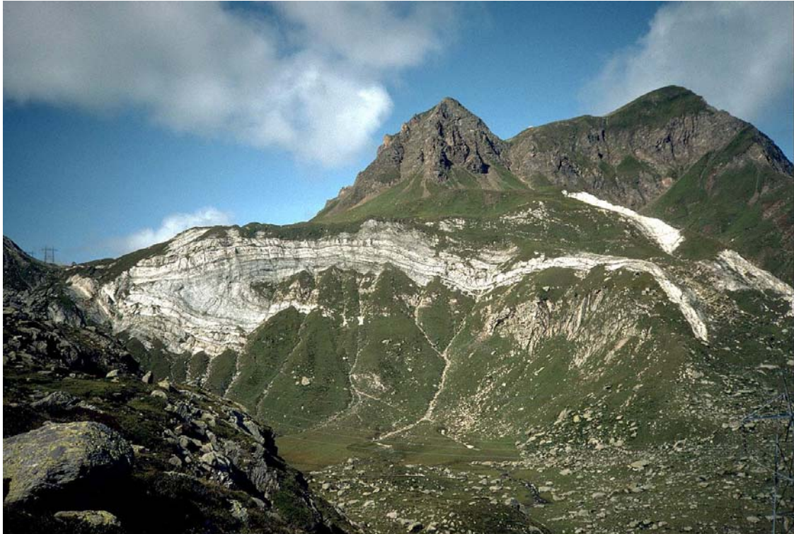
Figure 1. The impressive fold of Triassic dolomite at Campolungo, seen from the east.

Pini made a second trip to the area a year later and again published his observations, in 1783 (see Table 2). Both works were translated into German. He further wrote a supplement a year after. None of these works contains the name tremolite. In his reports Pini complains about the bad weather that prevented him from visiting more places; Campolungo is not a locality he mentions or otherwise describes in his memoirs. In a later work published in 1786 (see Table 2), Pini for the first time published a few lines on a new unnamed mineral which, based on this short description, appears to have been tremolite. In 1790, by which time the term “tremolite” had started to gain acceptance (see above), he more thoroughly described the Campolungo dolomite outcrops and clearly identified tremolite among their constituent minerals. However, he designates tremolite as scerlo bianco , “white schörl,” and gives only a vague locality designation as Valle Maggia (see map in Figure 2).