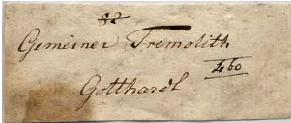
Figure 4. Label accompanying a tremolite specimen from Campolungo in the Struve collection, now in the Musée Cantonal de Géologie in Lausanne.

Ferber (1789), Drey Briefe mineralogischen Inhalts, an Freyherrn von Racknitz , p. 22.