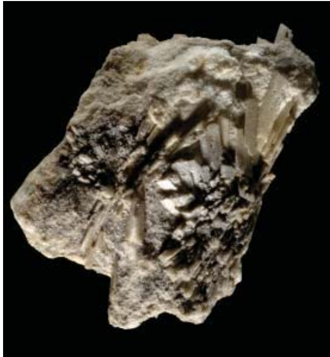
Figure 5. Tremolite specimen from the type locality in the Struve collection, Musée Cantonal de Géologie in Lausanne.