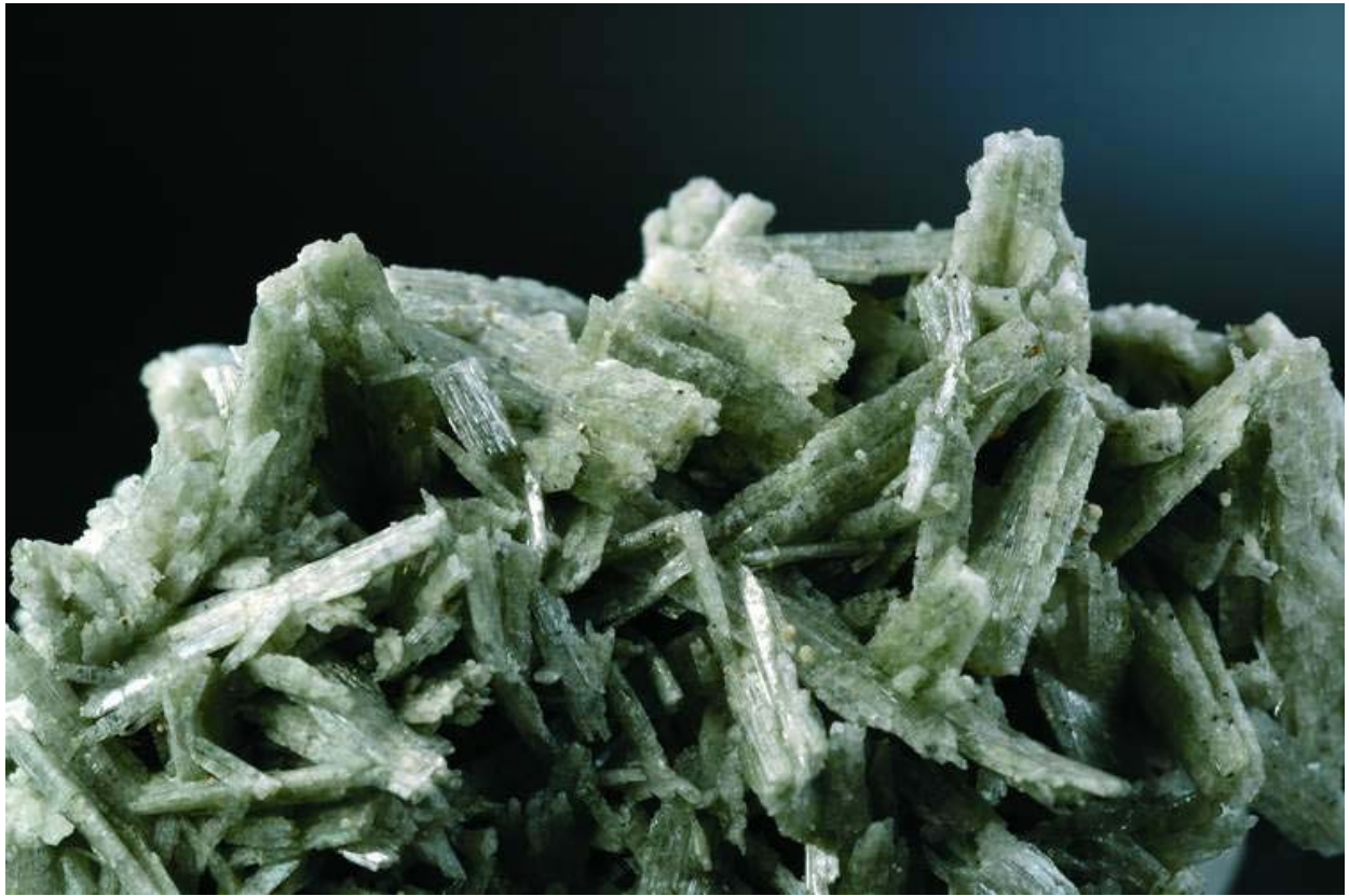
Figure 6. Tremolite colored in green by inclusions of chlorite particles, from Val Maighels, Grisons, Switzerland.

Höpfner was not aware of the correct locality for his new mineral. As already mentioned, the first complete description of the Triassic dolomite locality of Campolungo was given by Pini in 1790, even if he only vaguely spoke about Valle Maggia (see map in Fig. 2). Detailed and geographically correct descriptions of the tremolite type locality later appeared in Fleuriau de Bellevue (1792) and in de Mechel (1795) (see Table 1), the latter with a map of the area by Exchaquet and a catalog of the Gotthard minerals by Berthoud van Berchem and Struve.