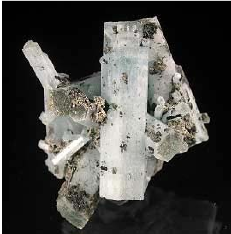
Aquamarine beryl, 5.8 cm, from the Huanggangliang mine, Chifeng, Inner Mongolia Autonomous Region, China.