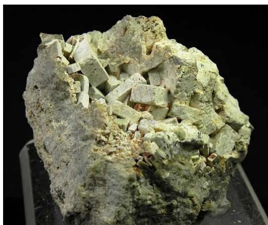
Gehlinite, 6 cm, from Hunedoara, Hunedoara County, Transylvania, Romania.

And then there is gehlinite , a rare Ca-Al silicate characteristically found in high-temperature skarn environments. The Italian dealership called The Webmineralshop ( www.webmineralshop.com ) has latched onto two cabinet-size pieces from a “new find” at Hunedoara, Romania, with sharp, chalk-white, short-prismatic crystals to 2 cm lining a cavity in massive gehlinite.