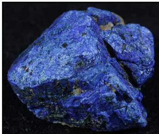
Chalcostibite coated by azurite, 3.2 cm, from Gar Al Anz, Morocco.

Now that we are onto “rare oddities” ( \approx “odd rarities”; either way you have to love them), consider the ten large-miniature-size specimens of chalcostibite from Gar Al Anz, Morocco, now being offered by Christopher J. Stefano Fine Minerals ( www.stefanmineralstore.com ). Chalcostibite, \text{CuSbS}_2 , is black and metallic, but at this little copper deposit—mined in the 1920s and 1930s and only occasionally productive of mineral specimens since then—it occurs as crude crystals which are solidly coated or partially replaced by azurite, rendering them an attractive dark blue. It is very unusual to see as many as ten chalcostibite specimens from Morocco in one place at one time.