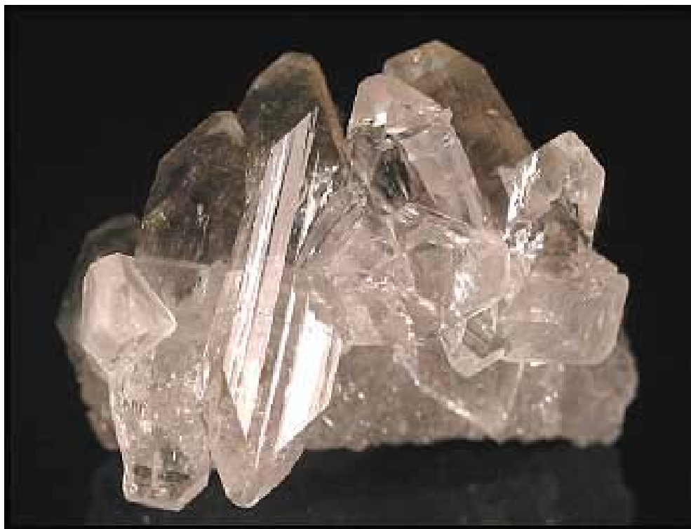
Apophyllite, 2.6 cm, from the Huanggangliang mine, Chifeng, Inner Mongolia Autonomous Region, China. Khyber Minerals specimen and photo.