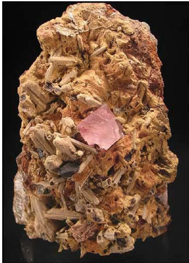
Fluorite with genthelvite crystals, 17.4 cm matrix, from the Huanggangliang mine, Chifeng, Inner Mongolia Autonomous Region, China. Khyber Minerals specimen and photo.