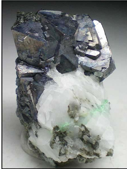
Gersdorffite, 4.1 cm, from the Ait Ahmane mine, Bou Azzer, Morocco. Trinity Minerals specimen and photo.