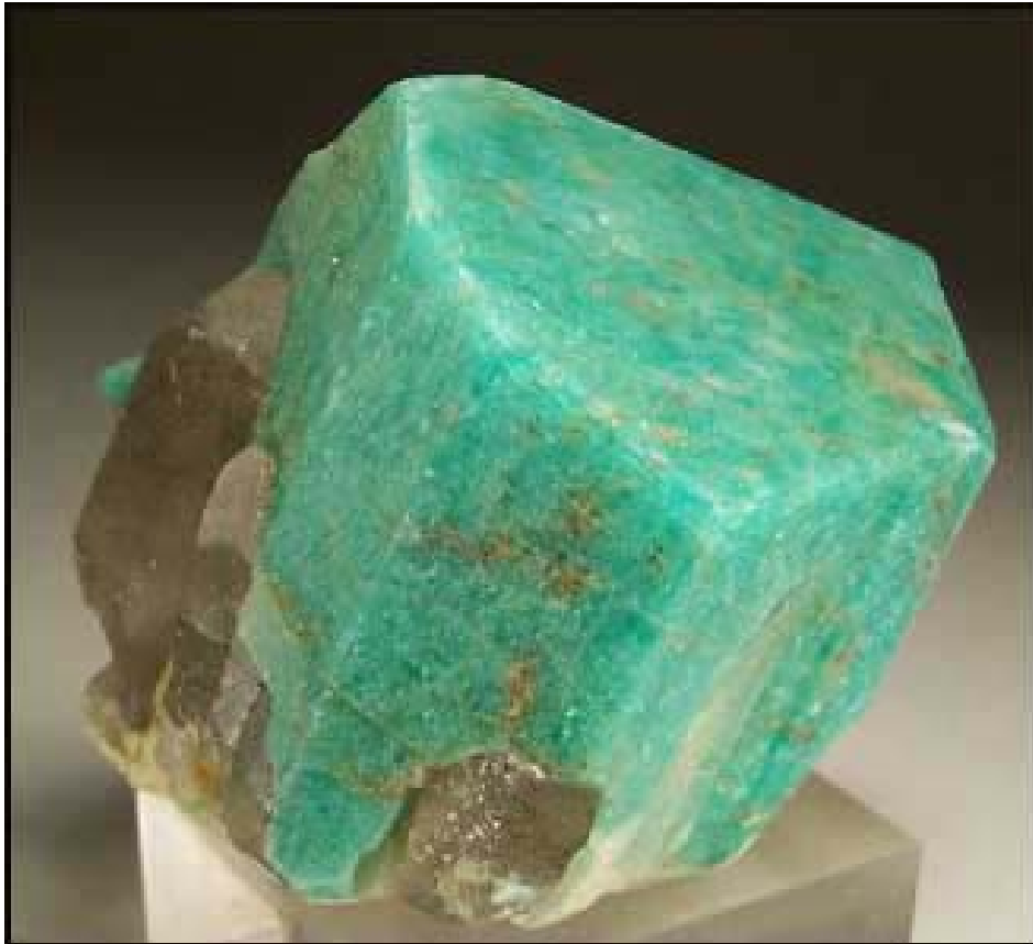
Microcline (“amazonite”), 6.5 cm, from Kenticha, Negele area, Sidamo Province, Ethiopia. Trinity Minerals specimen and photo.