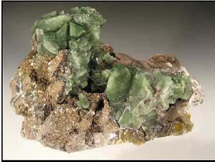
Ludlamite, 8.3 cm, from the Estafío Orcko mine, Cornelio Saavedra Province, Potosí Department, Bolivia.

matrix pieces to small-cabinet size with buttery-looking little fresnoite crystals all over. If you haven't already done so, it's time you checked out this material...another American classic.