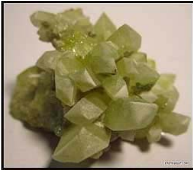
Datolite, 3.2 cm, from the Huanggangliang mine, Chifeng, Inner Mongolia Autonomous Region, China. Chen Xiao Jun China Minerals specimen and photo.