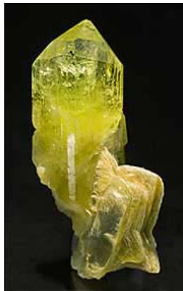
Brazilianite, 5.3 cm, from the Telirio mine, Linópolis, Minas Gerais, Brazil.

In 2007 a new German locality for galena joined the long list of classic venerables of the kind, when the Mayer limestone quarry, 15 km east of the old Carolingian capital city of Aachen, in Nordrhein-Westfalen, produced about 2,500 galena crystal groups from a big, pockety sulfide zone on the quarry's floor. The specimens all look much alike, but it is a good way to look: they are tight clusters of metallic gray and highly lustrous, octahedral to cuboctahedral galena crystals to 3 cm individually. The specimens have no matrix or visible associated species, and they reach mid-cabinet size. Mayer quarry galena has gotten scarce during the past few years, but now Jordi Fabre ( www.fabreminerals.com ) has 10 excellent examples, large-miniature to small-cabinet size, on his site. And for an aesthetic change of pace, see also Jordi's five fine miniatures of that favorite of young and old, brazilianite , in bright yellow, gemmy, lustrous, wedge-terminated blades to 4 cm, with crystals of muscovite and orthoclase. Jordi gives the locality for these pretty pieces only as Linópolis, Divino de Larenjeiras, Minas Gerais—but experience suggests that their specific source can only be the Marcel Telirio mine.