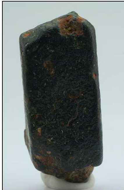
Thorite, 1.8 cm, from Ohn Bin Yee Hywet, Le-Oo, Mogok, Mandalay Division, Myanmar.

vein-dikes in Ontario, but thorite from Myanmar comes as very sharp, short-prismatic, terminated black crystals to 2 centimeters long. The crystals are found in alluvium at Ohn Bin Yee Hywet, Le-Oo, northeast of Mogok, but according to Crystal Treasure their “primary source” (perhaps a uraniferous pegmatite?) might be Oh Saung Taung, Le-Oo. I will mention as well the site’s interesting specimens of mica-group species, including pale brown, gemmy crystals of phlogopite embedded in white calcite, and botryoidal muscovite as miniature-size, smooth-surfaced, silvery spheres composed of curved plates layered over each other—these said simply to be from “Mogok.”