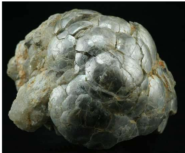
Muscovite, 3.3 cm, from Mogok, Mandalay Division, Myanmar.