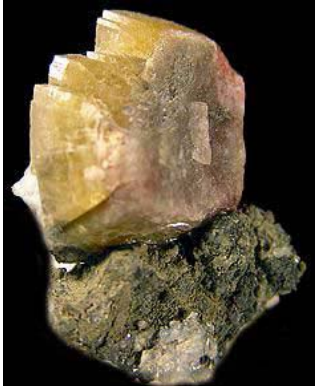
Fresnoite, 2 cm, from the Junnila property, Clear Creek district, San Benito County, California.