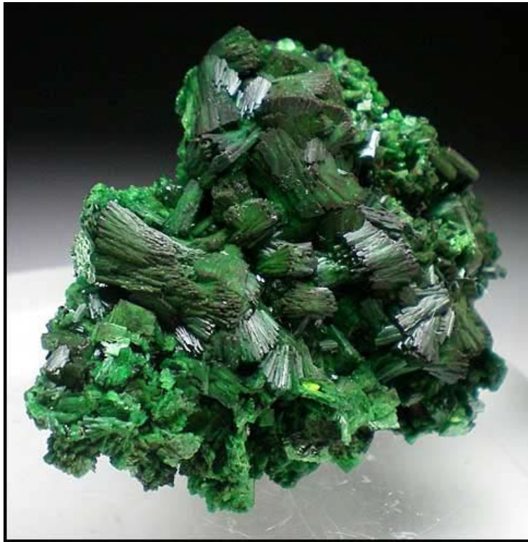
Torbernite, 5.3 cm, from the Margabal mine, Entraygues, Aveyron, France.

This small uranium mine, in a small deposit discovered during a survey by the French Atomic Energy Commission in the late 1950s, produced some world-class torbernite crystal groups in the early 1960s. By 1968, when Paul Desautels' The Mineral Kingdom was published, a picture therein of a Margabal torbernite was accompanied by Desautels' mournful remark that such specimens had become "unavailable to collectors." But at the 1990 Munich show I spotted a handful of excellent thumbnails showing sharp, blocky torbernite crystals to 1 cm aesthetically grouped on matrix; they had been dug by a couple of French collectors in 1989. I actually thought for a while that the specimen I purchased had to be one of the finest small torbernites in captivity...but soon (maybe you know the feeling) my presumptuous dream was shattered.