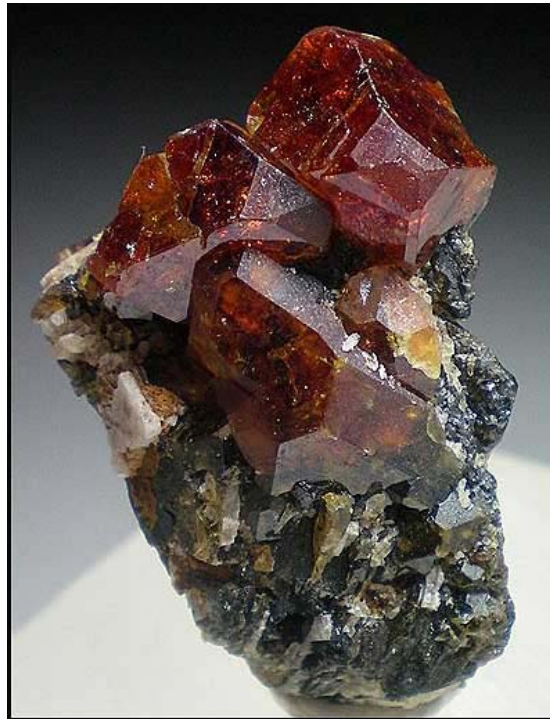
Microlite, 2.5 cm, from Macoa, Alto Ligonha, Zambezia Province, Mozambique. Trinity Minerals specimen and photo.