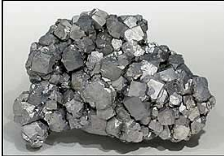
Galena, 9.5 cm, from the Mayer quarry, Eschweiler-Hastenrath near Aachen, Nordrhein-Westfalen, Germany.

In 2007 a new German locality for galena joined the long list of classic venerables of the kind, when the Mayer limestone quarry, 15 km east of the old Carolingian capital city of Aachen, in Nordrhein-Westfalen, produced about 2,500 galena crystal groups from a big, pockety sulfide zone on the quarry's floor. The specimens all look much alike, but it is a good way to look: they are tight clusters of metallic gray and highly lustrous, octahedral to cuboctahedral galena crystals to 3 cm individually. The specimens have no matrix or visible associated species, and they reach mid-cabinet size. Mayer quarry galena has gotten scarce during the past few years, but now Jordi Fabre ( www.fabreminerals.com ) has 10 excellent examples, large-miniature to small-cabinet size, on his site. And for an aesthetic change of pace, see also Jordi's five fine miniatures of that favorite of young and old, brazilianite , in bright yellow, gemmy, lustrous, wedge-terminated blades to 4 cm, with crystals of muscovite and orthoclase. Jordi gives the locality for these pretty pieces only as Linópolis, Divino de Larenjeiras, Minas Gerais—but experience suggests that their specific source can only be the Marcel Telirio mine.