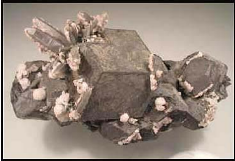
Magnetite, 21.7 cm, from the Huanggangliang mine, Chifeng, Inner Mongolia Autonomous Region, China. Khyber Minerals specimen and photo.