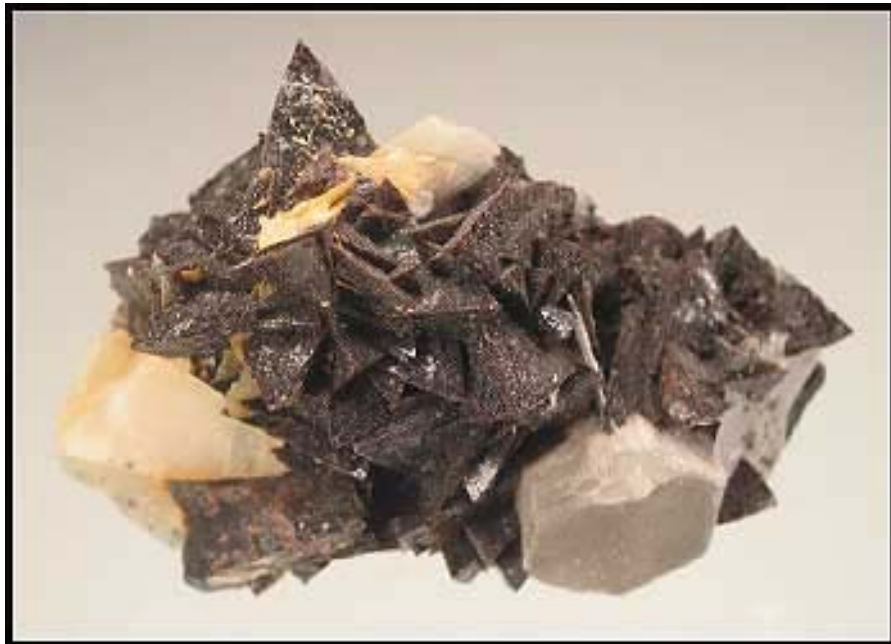
Genthelvite, 6.2 cm, from the Huanggangliang mine, Chifeng, Inner Mongolia Autonomous Region, China.