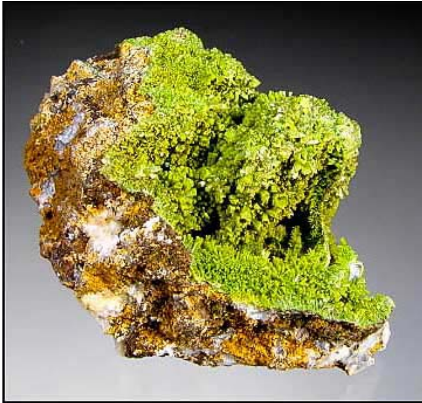
Pyromorphite, 5 cm, from the Lavarock Hall vein, Leadhills, Scotland. Dakota Matrix Minerals specimen and photo.

An alluring spread of colorful old-time specimens of pyromorphite can be found in a November 10 posting called “Pyromorphite Special Edition” on Tom Loomis’s Dakota Matrix Minerals site ( www.dakotamatrix.com ). A few of the specimens come from long-gone German localities but the majority come from equally venerable places in the United Kingdom, e.g. Caldbeck Fells, Cumbria, England; the Force Crag mine, Cumbria, England; the Pengenna mine, St. Teath, Cornwall, England; the Bwlch Glas mine, Dyfed, Wales; the East Stayvoyage vein, Leadhills, Scotland; and more. They all show druses of microcrystals in vugs in what look uniformly like siliceous-gossany matrix. The specimens are all bright, bristly and clean-looking, and you won’t easily find their likes elsewhere.